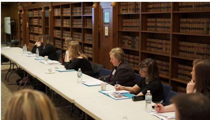
Attendees preparing to talk to the legislators.