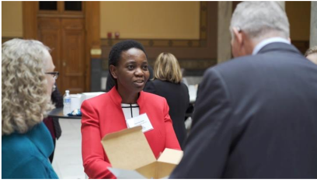
Lunch with the Legislators.