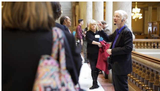
Tour of the Statehouse.