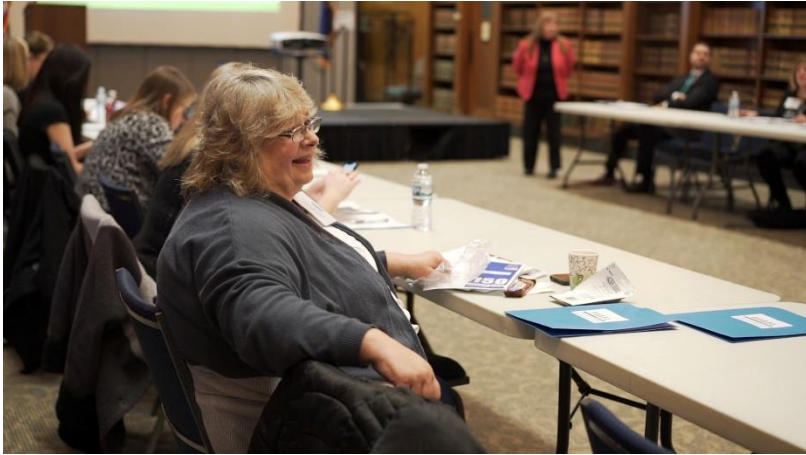
Attendees preparing to talk to the legislators – and having a little fun!