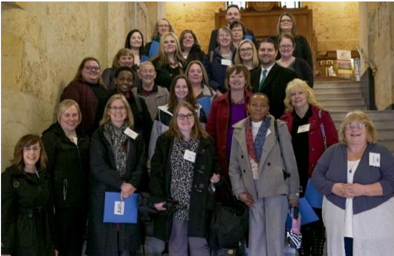
Great turnout at the 2020 IHIMA Day at the Indiana Statehouse! Attendees at IHIMA Day at the Statehouse.