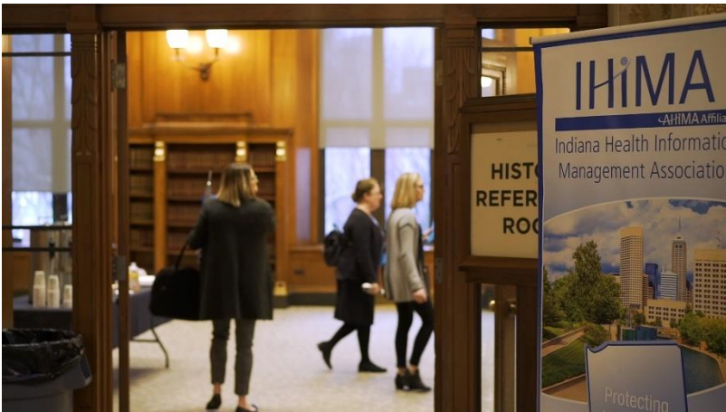
Getting started for the IHIMA Day at the Statehouse!